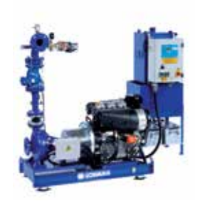
GEM...J Single electric service pump module, with jockey pump on board

A range of accessories are also available, such as a flow meter, reduction suction taper and alarm panels. The booster sets also feature either an automatic self-test or automatic shut off feature which allows maintenance of the system to be performed without the need to shut down the system fully.